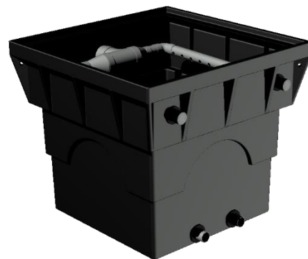
GWS10 Filtration Tank

The water that exits in the filtration tank is classified as having undergone "Primary Treatment" and must be distributed into trenches as specified by your engineer. Make sure their size calculation does not include an allowance for toilet water, which would make the trenches unnecessarily large and expensive