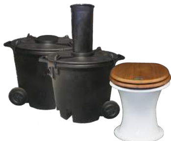
Pandora + Premium Timber seat

Please choose the pedestal & seat option to suit your Classic 850 system.