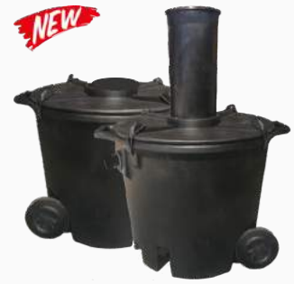
Model pictured Nature Loo Classic 850-2

The Nature Loo solution is free of odours, chemicals, pollution, pumps, high maintenance and electrical costs. It also saves the typical family some 35,000 litres of water per year.