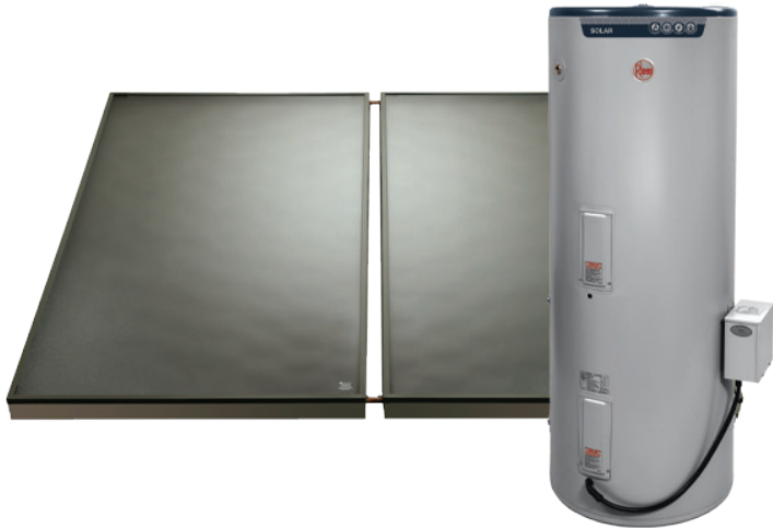
MODEL NO. 5A2325/2NPT