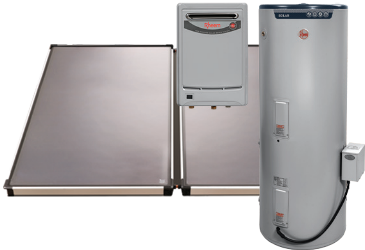
MODEL NO. 5A2325/2NPT-G

To ensure you have hot water all year round a Rheem Loline® Solar Stainless Steel water heater is available with either in-tank electric boosting or 6 star 26L/min continuous flow gas boosting. Boosting is a back-up feature that provides hot water at times of low solar energy gain, such as during very cloudy or rainy weather, or during the colder months or periods of increased hot water demand.